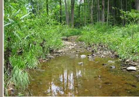
16 Months Post-Construction