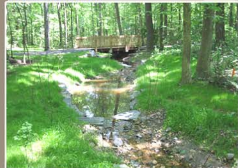
4 Months Post-Construction