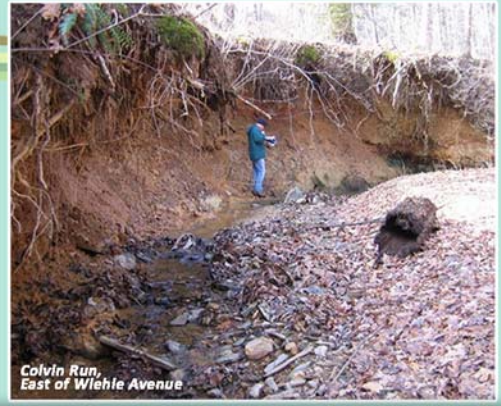
Streambank erosion threatens roads, trails, trees and utilities in Reston

The Northern Virginia Stream Restoration Bank (NVSRB) is a partnership between Wetland Studies and Solutions, Inc. (WSSI) and The Peterson Companies, working in concert with the Reston Association. The Phase 1 goal of NVSRB is to restore 14 miles of degraded streams in the Snakeden, Glade and Colvin Run Watersheds in Reston, Virginia.