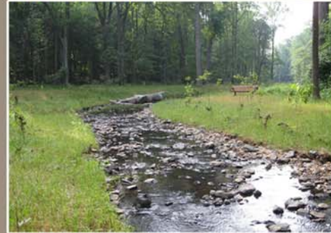
6 Months Post-Construction