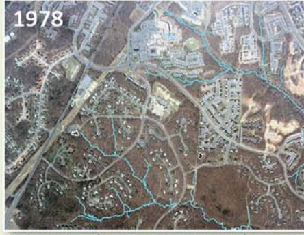
Hunters Woods area in the early stages of development.