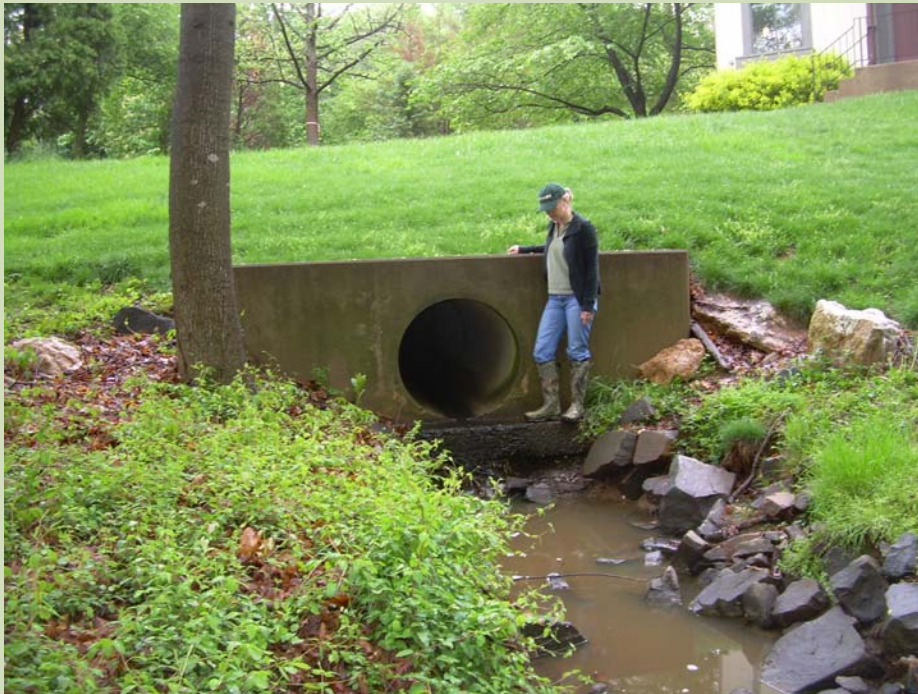
Looking upstream at Culvert Outfall