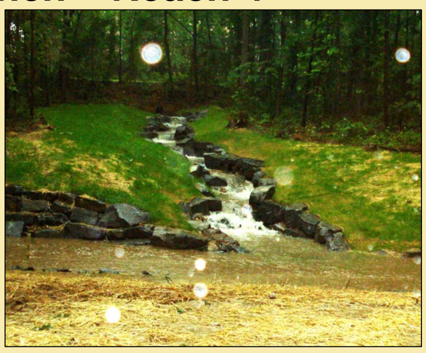
After – May 2008 (1 week after construction)