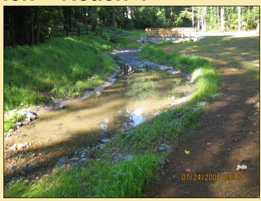
After – July 2008 (1 month after construction)