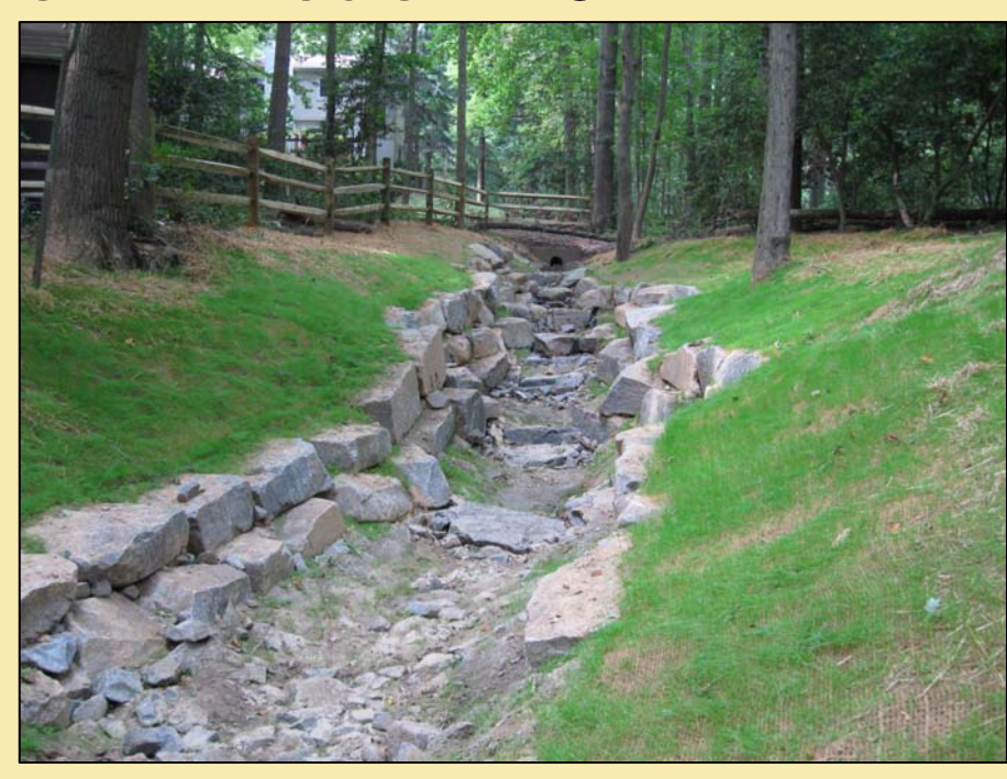
After – August 2008 (1 month after construction)