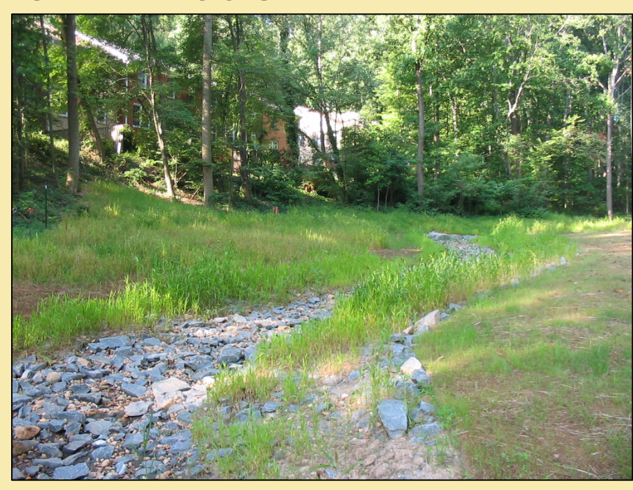
After – July 2008 (1 month after construction)