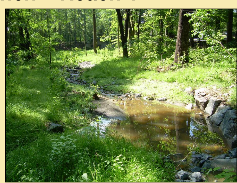
After - June 2008