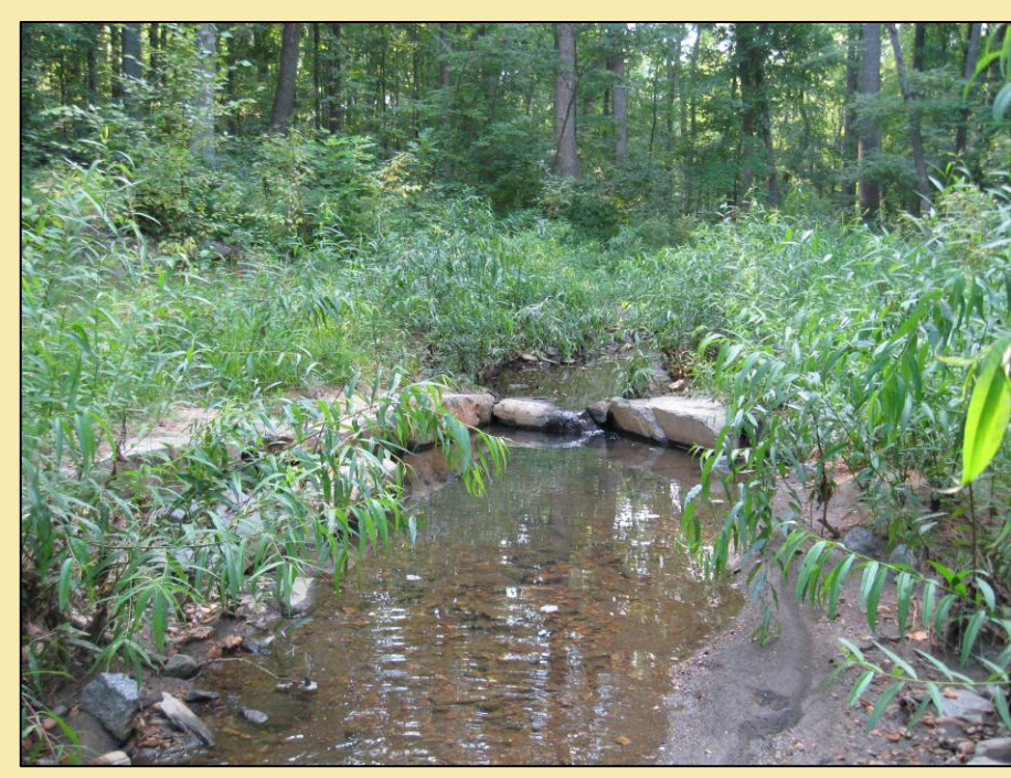
After – August 2008