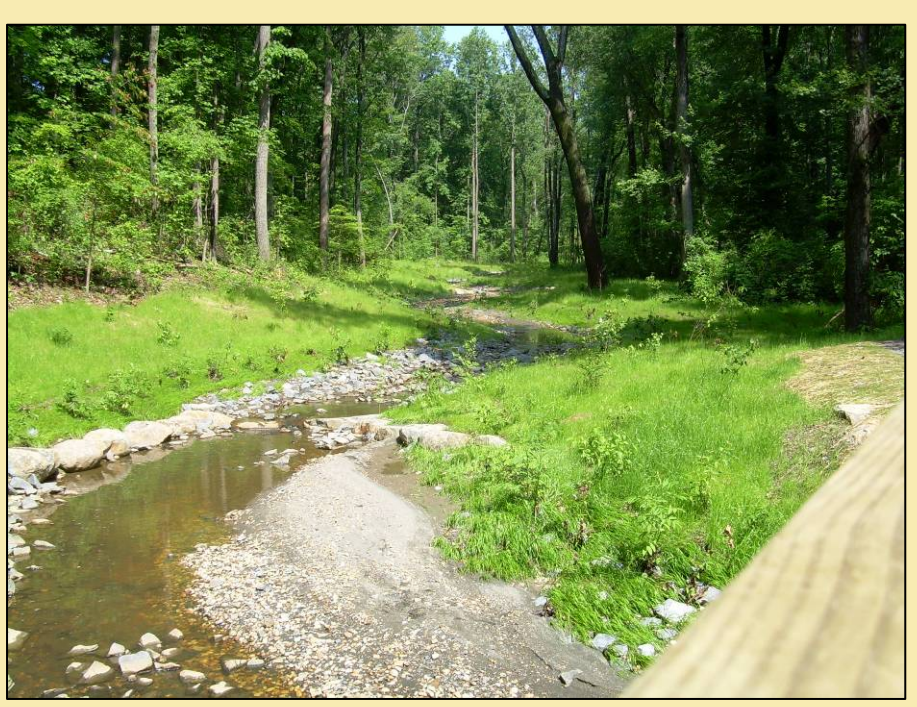
After – July 2008