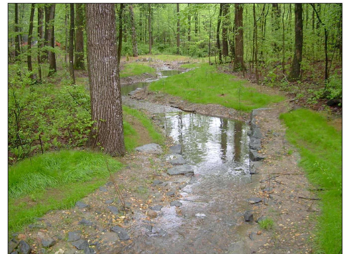
GLADE REACH 1 - MODIFIED CROSS VANE