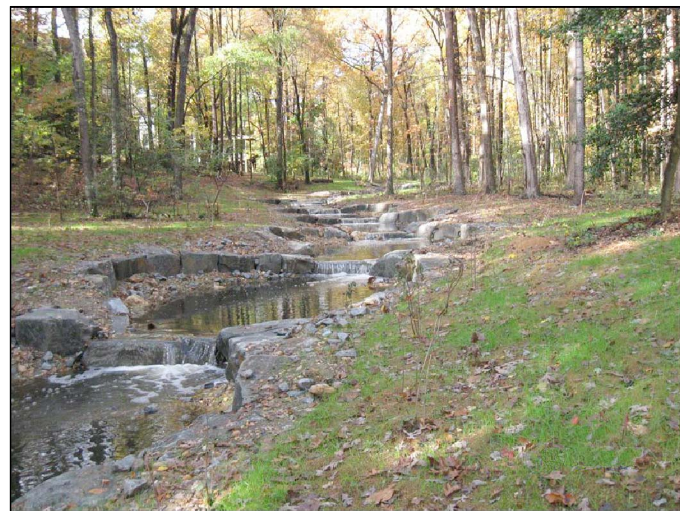
SNAKEDEN REACH 13 - STEP POOLS

k:\Cadd Files\Stream Restoration\Details-D-LiveStake.dwg